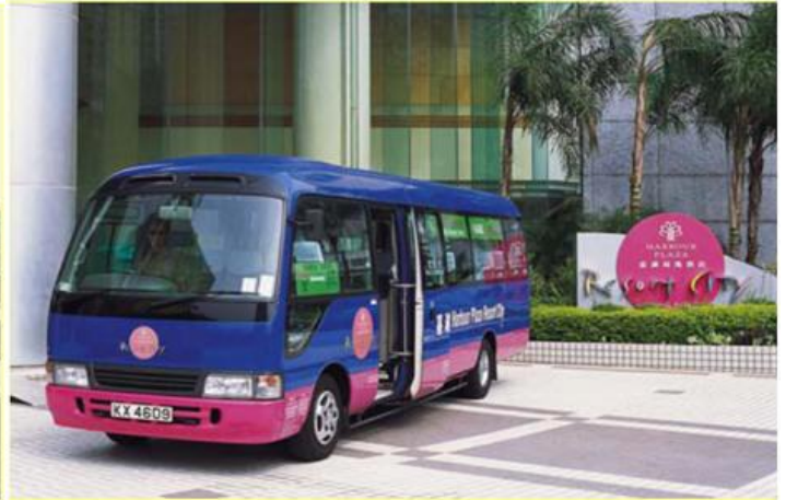
Shuttle Bus (Hotel between Tsim Sha Tsui/Airport)